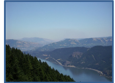
Columbia River Gorge